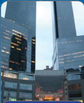
TIME WARNER COMPLEX