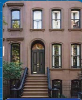
WEST VILLAGE TERRACE INSPECTION