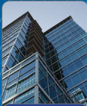
THE URBAN GLASS HOUSE