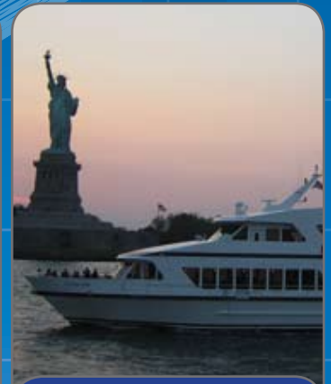
MANHATTAN YACHT CRUISE