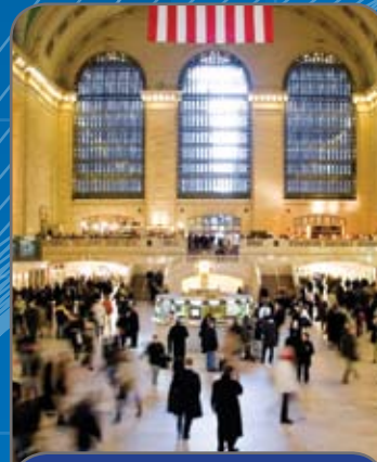
LUNCH AT GRAND CENTRAL STATION