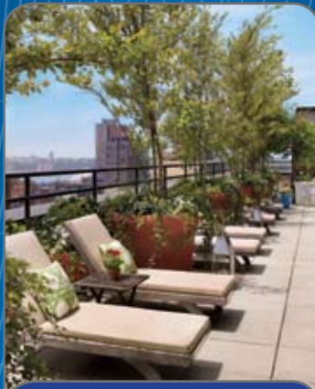
COCKTAILS AT HUDSON TERRACE