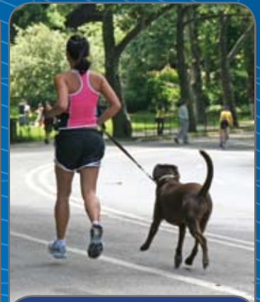
CENTRAL PARK TOUR