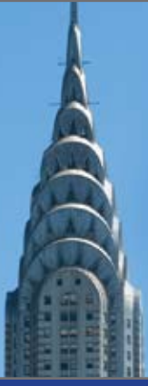
CHRYSLER BUILDING OFFICES