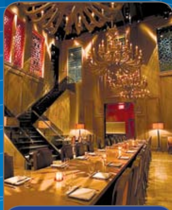
DINNER AT BUDDAKAN RESTAURANT