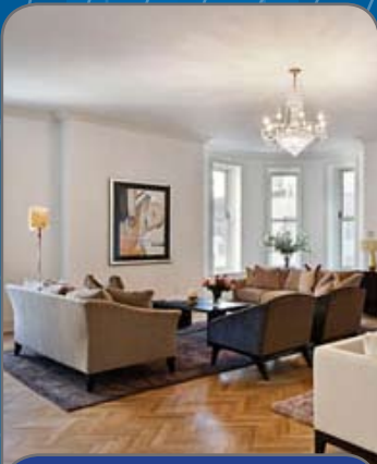
HALSTEAD PROPERTY INSPECTION