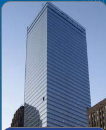
7 WORLD TRADE CENTER INSPECTION