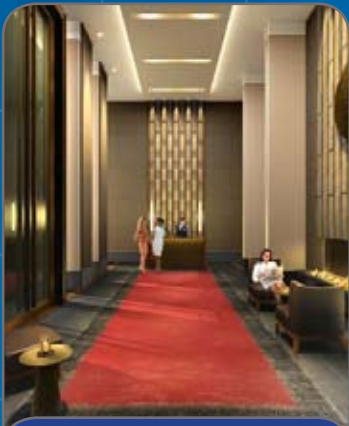
SETAI WALL STREET