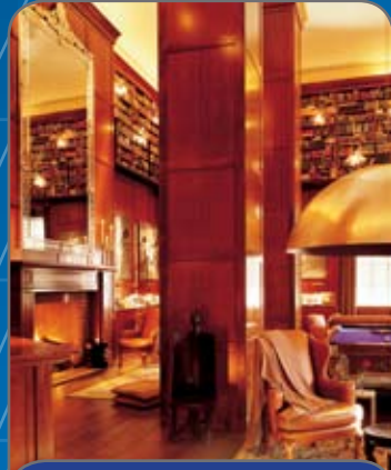
HUDSON HOTEL LIBRARY